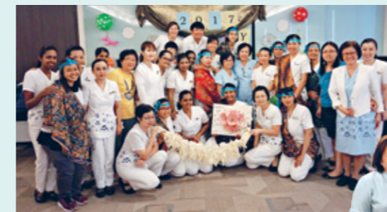
NUP nurses showed their creativity and energy with exciting performances and fun activities at the Nurses' Day celebrations held at each of the polyclinics. Senior management also served them lunch to show their appreciation for the nurses' hard work. From their big smiles, it's evident that all had a great time.