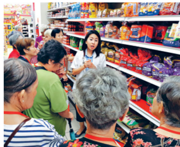
Dietitians shared how to choose heart-healthy options of everyday items like milk and bread.