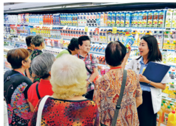
Participants were eager to learn how to understand product labels better.