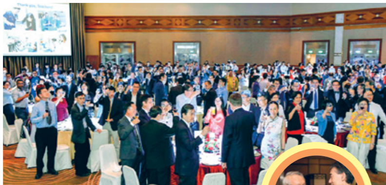
event was particularly significant for those from the Class of 1977 and 1967 as they celebrated their 40 th and 50 th anniversaries respectively.