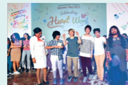
This year, the JurongHealth Campus' theme was "Celebrating Heart Work". Smiles and laughter were the order of the day as nursing staff took part in fun activities, including a lip sync battle, which featured some hilarious costumed characters.