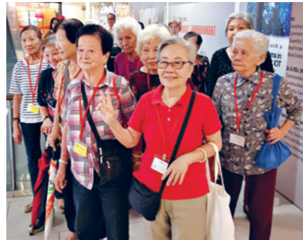
All smiles at the start of the tour.

Dietitians educated the elderly from the SilverACE senior activity centres on how to pick healthier foods when they shop for groceries, during a tour of the NTUC Fairprice at One@Kent Ridge organised by NUHCS on 18 May 2017.