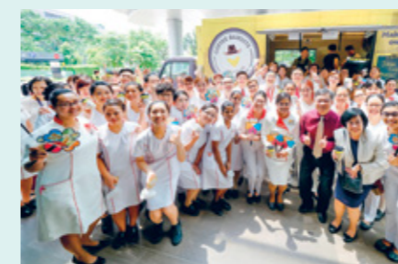
JurongHealth Campus celebrated Nurses' Day on 28 July with a mobile coffee truck which was parked outside NTFGH. Minister for Health Mr Gan Kim Yong made a special appearance and, together with NTFGH senior management, staff, patients and volunteers, bought hot drinks for the nurses.