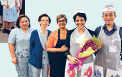
ALCNS and NUS Medicine marked Nurses' Day with its 11th annual Conventus event on 3 August. For the first time, an inauguration ceremony was held to welcome incoming nursing freshmen to ALCNS and the profession.