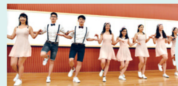
Joining the NUS Alice Lee Centre for Nursing Studies (ALCNS)'s nursing students at this year's Conventus were fellow NUS medical students, who wowed the 400-strong audience with their dance performance inspired by the Hollywood blockbuster, La La Land .