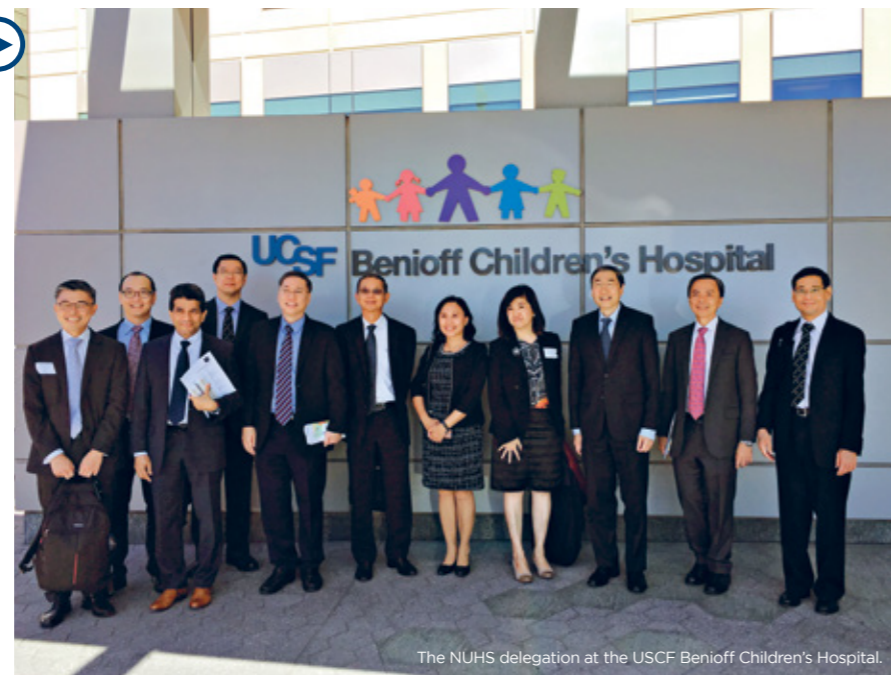
The NUHS delegation at the UCSF Benioff Children's Hospital.

The study trip offered some key learning points. Examples include how, at both UCSF